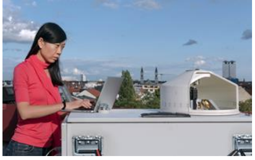
Fig. 1: (left) measurement principle of differential column measurement, (right) automated sensor system performing solar measurements to obtain the column-averaged concentrations of CO<sub>2</sub>, CH<sub>4</sub> and, CO.